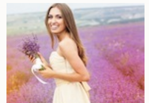
Blessings can be for single people and unmarried folks.