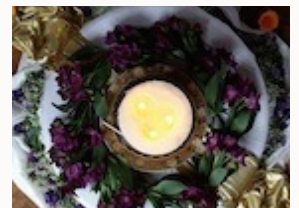
Uniquely chosen altar pieces for unique ceremonies.