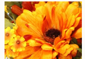
Sensitively held funerals, inspired by love.