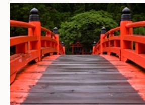
Rites of passage involve blessing an untrodden path.

Blessings and ceremonies for new homes, starting off in new directions, breaking from a partner or old way of life in a meaningful way, funerals and funeral ceremony planning, animal funerals and blessings.